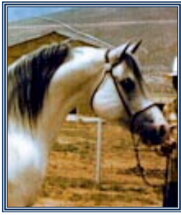
FOUNDATION STALLION Sierra Dunes 1968 - 1998 (Dunes x Trafara)